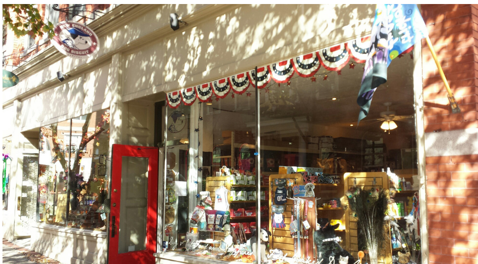
New England Dog Biscuit Company is in historic downtown Salem, just two doors down from Red's Sandwich Shop.

Now is the time to be a dog. When we were kids, dogs didn't have a lot of choice when it came to treats, toys and food. Times have changed. If you're looking for a special holiday gift for your four-legged friend, consider shopping at one of the local pet boutiques.