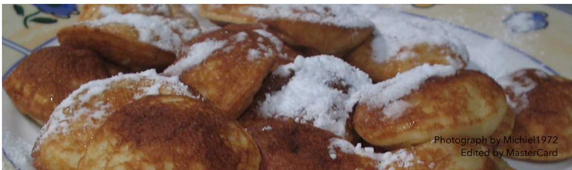
Photograph by Michiel1972 Edited by MasterCard